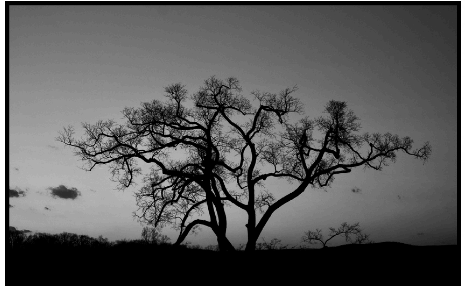
RIGHT: "THE NIGHTFALL." 2023