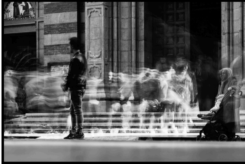
“THE FACE OF TIME.” 2023

“WHEN TAKING PHOTOGRAPHS, I AM OFTEN STRUCK BY THE FLUIDITY OF TIME. THE RELATIONSHIP OF TIME WITH SPACE AND PEOPLE. SOMETIMES IT IS THE GROWTH OF A PERSON, SOMETIMES THE AGING OF A STONE. FINALLY, ALL OF THEM ARE ERASED IN TIME. WHENEVER I TAKE A PHOTOGRAPH, I FEEL ONE STEP AWAY FROM THIS RESULT AND I FEEL THAT I HAVE TAKEN AWAY WHAT I HAVE PHOTOGRAPHED.”