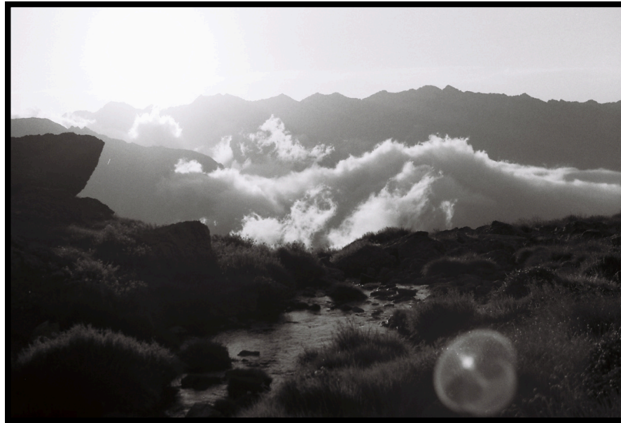
“CLOUDY MOUNTAINS.” 2023

“I AM A 22 YEARS OLD FRENCH STUDENT AND I HAVE STARTED PHOTOGRAPHY IN 2020 AFTER HAVING DISCOVERED A FILM CAMERA AND A FEW LENSES THAT BELONGED TO MY GRANDFATHER. SINCE THEN, TAKING PHOTOS HAS BECOME BOTH AN ARTISTIC WAY OF EXPRESSION AND A LINK TO MY GRANDPA WHOM I’VE NEVER MET. WHEN I’M USING MY CAMERA IS A DIALOG BETWEEN THE FEELING I WANT TO CONVEY, THE AESTHETIC EFFECT NEEDED TO DO SO AND THE SETTING OF THE PARAMETERS. INDEED, I AM USING A FULLY MECHANICAL CAMERA. AT THE BEGINNING IT WAS QUITE DIFFICULT BUT NOW THIS PROCESS AND THIS DUALITY BETWEEN AN ARTISTIC PROCESS AND A MORE TECHNICAL PART IS REALLY FLUENT. I AM MOSTLY TAKING LANDSCAPE PICTURES AS WELL AS DETAILS PHOTOS. I ESPECIALLY ENJOY USING THE BOKEH EFFECT WHICH IS QUITE AMAZING WITH THE OLD LENSES I USE. THE MAJORITY OF MY PICTURES ARE TAKEN DURING JOURNEYS. PHOTOGRAPHY HAS HELPED ME TO DEVELOP A MORE INQUISITIVE EYE WHEN I DISCOVER NEW PLACES, ENABLING ME TO APPRECIATE THEM BETTER.”