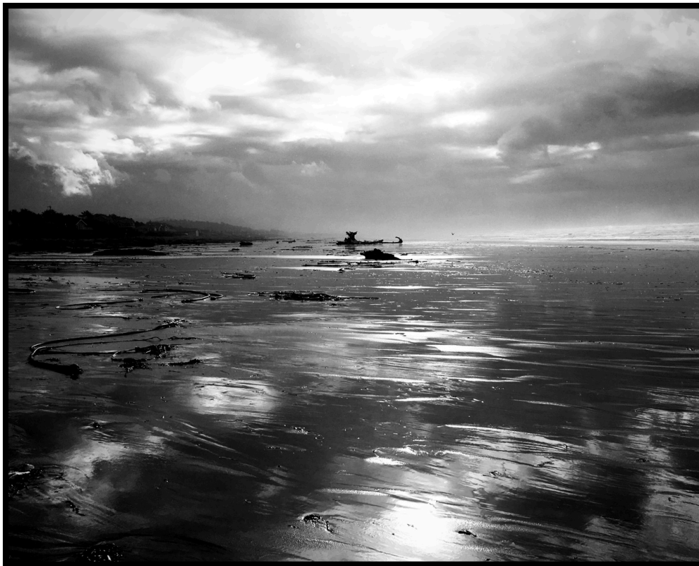
“SHINING SEA.” 2017

“PHOTOGRAPHY, FOR ME, IS ABOUT EXPLORING THE ABSTRACT QUALITIES IN NATURE AND ARCHITECTURE, EXAMINING COLOR, SHAPES AND PATTERNS AND HOW THEY RELATE, FINDING AN UNUSUAL ANGLE, PERSPECTIVE OR LIGHTING THAT WILL CHALLENGE THE CONVENTIONAL WAY OF VIEWING. MY SUBJECT MATTER VARIES AS TO WHATEVER HAPPENS TO CATCH MY EYE, WHETHER IT’S THE SYMMETRY AND BEAUTY IN NATURE, THE LINES AND DESIGN IN ARCHITECTURE, THE MOVEMENT OF THE SEA AND CLOUDS OR THE INTERACTION OF PEOPLE IN EVERYDAY LIFE.”