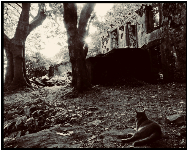
LEFT: “UNDERWORLD.” 2024

“THE ABSENCE OF COLOR I OFTEN SEE AS A GIFT. IT OFFERS ME THE SPACE TO FOCUS ON LIGHT AND SHADOW, ON COMPOSITION. ON THE ESSENCE OF AN IMAGE, THE STORY IT TELLS, THE VISUAL POETRY IT CREATES.”