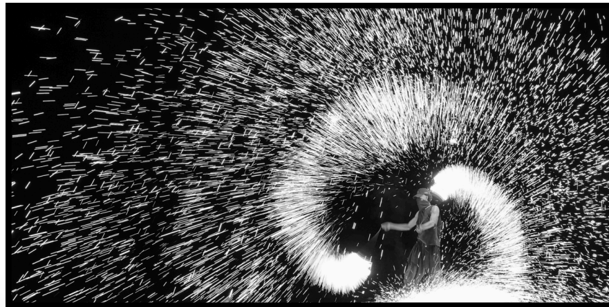
“MAN OF FIRE.” 2024

“I CONSIDER MY WORK AS A TESTIMONY OF SCENES OF NATURAL PHENOMENA, OR EVEN SCENES OF HUMAN ACTIVITY AND ITS INTERACTION WITH NATURE. IT IS VERY OFTEN A MATTER OF SHOWING WHAT I SEE WITH MY SENSITIVITY, AND OF DRAWING THE ATTENTION OF OTHERS TO A COLOUR, SHAPE OR MOVEMENT THAT THEIR EYE WOULD NOT HAVE SEEN. RATHER THAN TRYING TO COMPOSE AN IMAGE, A THEATER, I SEEK THE MAGIC OF THE MOMENT, THAT WHICH IS RARELY REPEATED. WHEN THE PHOTOGRAPH IS SUFFICIENT IN ITSELF, IT WILL INTEGRATE MY REALISTIC COLLECTION; SOMETIMES I MANIPULATE THE PHOTOGRAPHY IN POST-PRODUCTION TO SUBLIMATE IT AND GIVE IT A MORE UNUSUAL OR PLASTIC CHARACTER.”