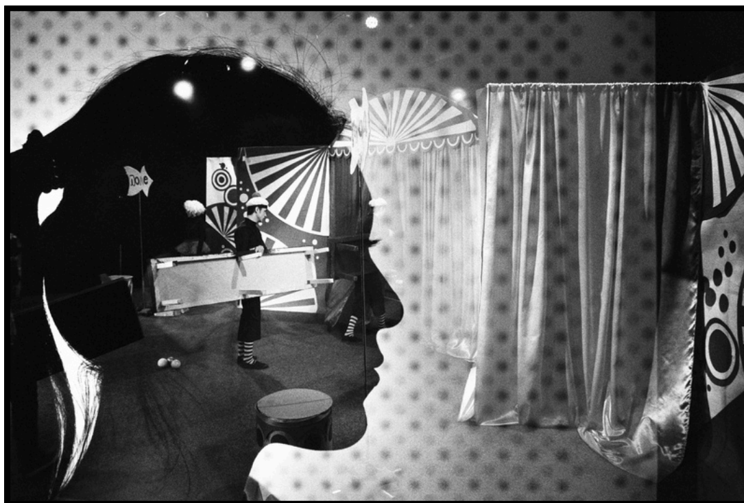
“THEATER LAYERS.” 2023

HE PHOTOGRAPHS ON 35MM FILM AND DIGITAL, MERGING CLASSICAL AND CONTEMPORARY TECHNIQUES, BASIC REALITY AND OTHERWORLDLY VISION.