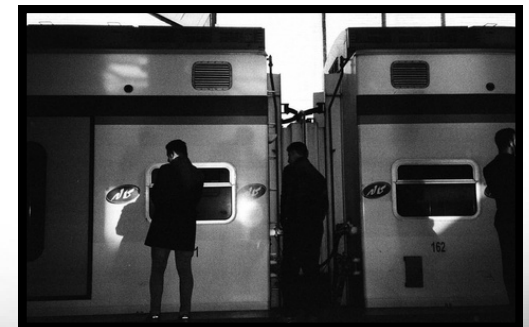
TOP: "UNTITLED." 2020