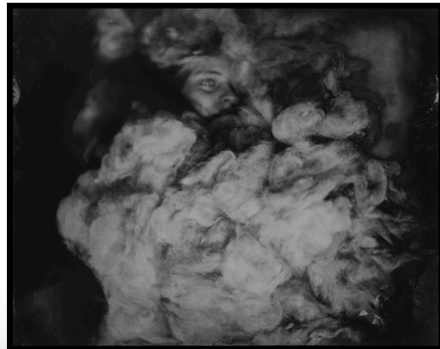
"PLAQUE 226." 2024

FOR HIM, IT IS TRULY A POETIC ACT TO CAPTURE FEELINGS OF ESCAPE AND ELEVATION OF THE SPIRIT AND THEN TRANSFORM, METAMORPHOSE OR REINVENT THEM INTO PHOTOGRAPHIC COMPOSITIONS.