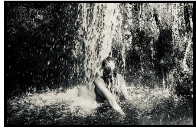
TOP RIGHT: “SPLASH!” 2022