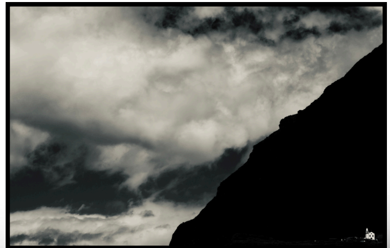
BOTTOM RIGHT: “WHITE CHURCH.” 2024