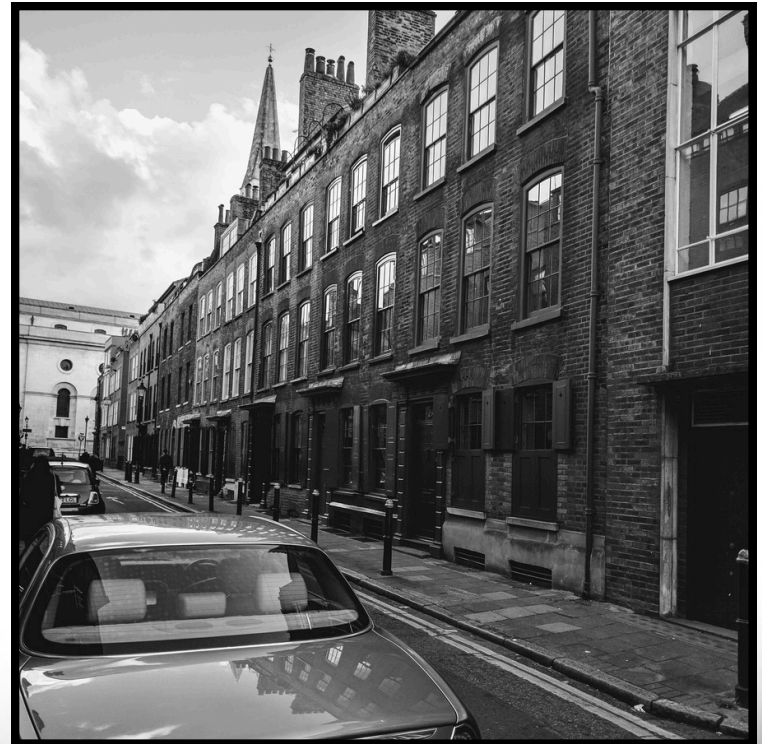
"OLD EAST LONDON." 2017

"I LOVE PHOTOGRAPHY. I HAVE ALWAYS LOVED PHOTOGRAPHY, ESPECIALLY THE KIND THAT IS REAL, CANDID AND IN THE MOMENT. I AM DRAWN TO BLACK AND WHITE PHOTOGRAPHY FOR THAT REASON, IT ALWAYS FELT REAL. MY PHOTOGRAPHY IS PERSONAL. IT IS PLACES I HAVE TRAVELED TO WITH PEOPLE THAT I LOVE. IT IS PLACES THAT HAVE STORIES AND MEMORIES. IT IS MOMENTS IN TIME YOU WISH YOU COULD GO BACK TO. I WANT PEOPLE TO SEE THESE PLACES FROM MY PERSPECTIVE AND HOPEFULLY INSPIRE OTHERS TO START CAPTURING MOMENTS FOR THEMSELVES."