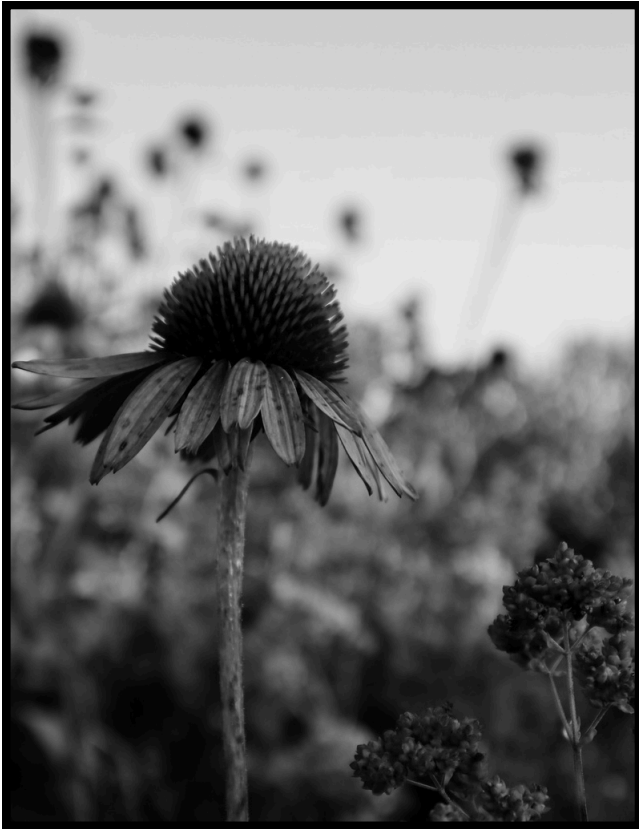
LEFT: "ALONE." 2024

"I AM A SOPHOMORE AT PENN STATE UNIVERSITY IN THE US. I WAS BORN IN FLORIDA BUT HAVE LIVED IN NEW YORK FOR THE LAST 6 PLUS YEARS. I AM STUDYING PROFESSIONAL PHOTOGRAPHY AND HAVE A PASSION FOR ALL THINGS NATURE AND LANDSCAPE. MY DREAM JOB WOULD BE TRAVELING THE WORLD AND TAKING PICTURES."