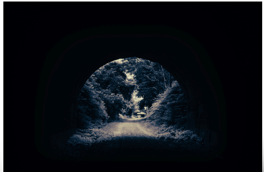
“SPIRITED AWAY.” 2024

“MY FAVORITE STYLE OF PHOTOGRAPHY IS SIMPLY EXPLORATION, WHETHER RURAL, URBAN, OR ANYTHING IN BETWEEN. I FREQUENT BIG CITIES, SMALL TOWNS, AND NUMEROUS PARKS (AMONG OTHER LOCATIONS). MUCH OF THE FLORA, FAUNA, AND OTHER CURIOSITIES I’VE DISCOVERED HAVE BEEN IN SEEMINGLY RANDOM LOCATIONS. MANY PHOTOS INCLUDE URBEX AND RUREX FINDINGS FROM SEVERAL AREAS IN APPALACHIA AND THE MIDWEST. I HOPE TO CONTINUE EXPLORING NEW PLACES AND SEEING WHAT THERE IS TO DISCOVER.”