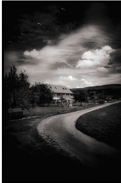
“WINDING ROAD.” 2022